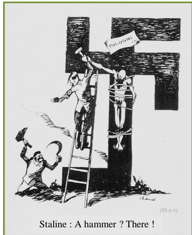
Staline : A hammer ? There !

- There were three nations all in all, came the reply. But there are only two and a half left. The third [understand: Italy] was cut in half. Its northern part is still expansionist while its southern part is a great and good democratic nation.